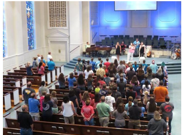
Worship (above) Fun Stuff (below)