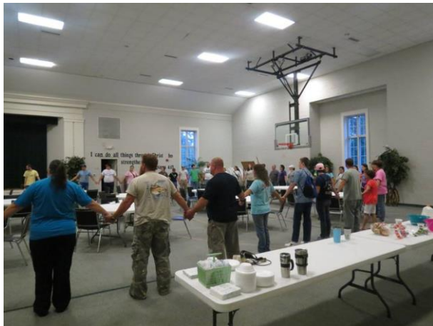
The Great Send-Off Prayer Time on Monday